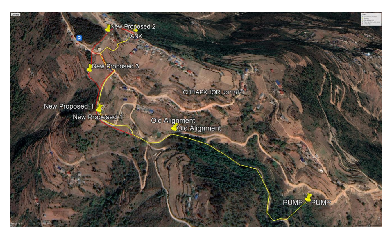
Fig: Google Map showing the possible new routes of pipe with red lines