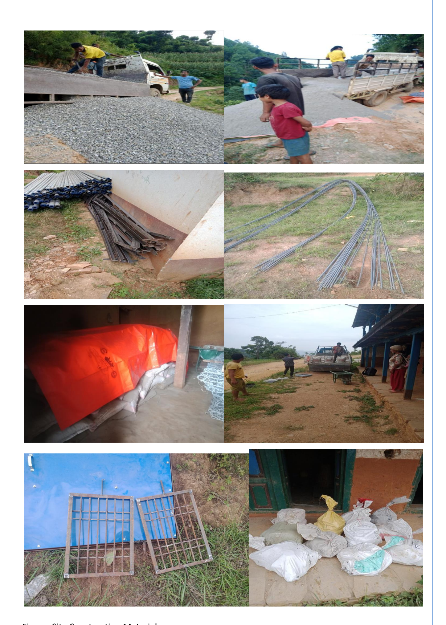
Figure: Site Construction Materials