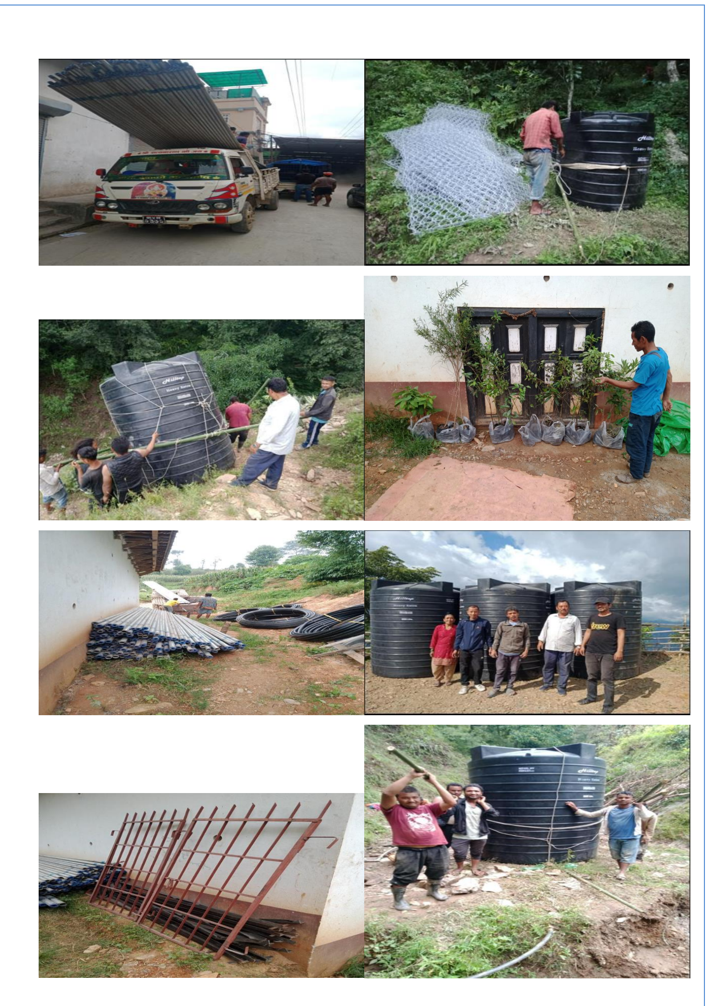
Figure: Site Construction Materials