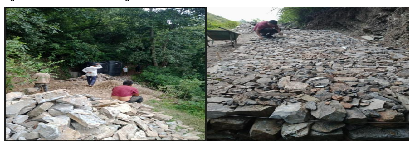
Figure: Excavation, Soling work for downstream reservoir tank