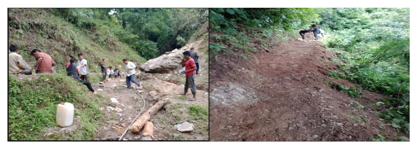
Figure: Site Clearance and making foot rails