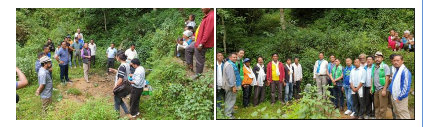
Figure: Commence of work with rituals