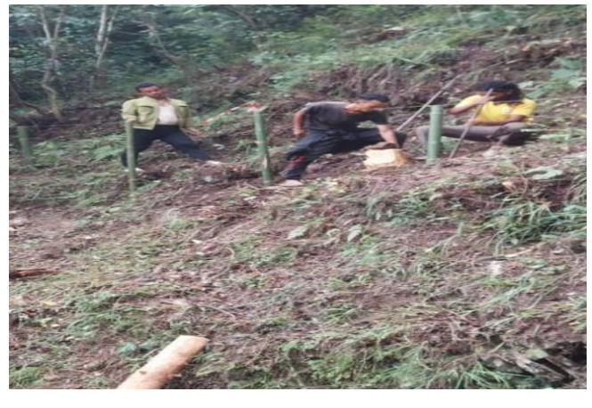
Figure: Start of bioengineering work