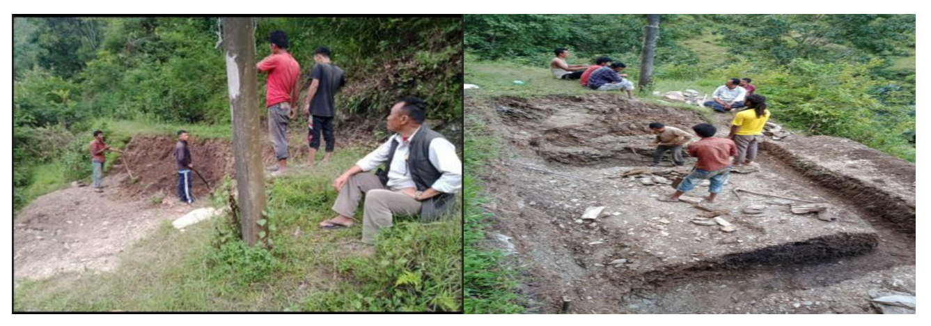
Figure: Excavation, and site preparation for Pump House