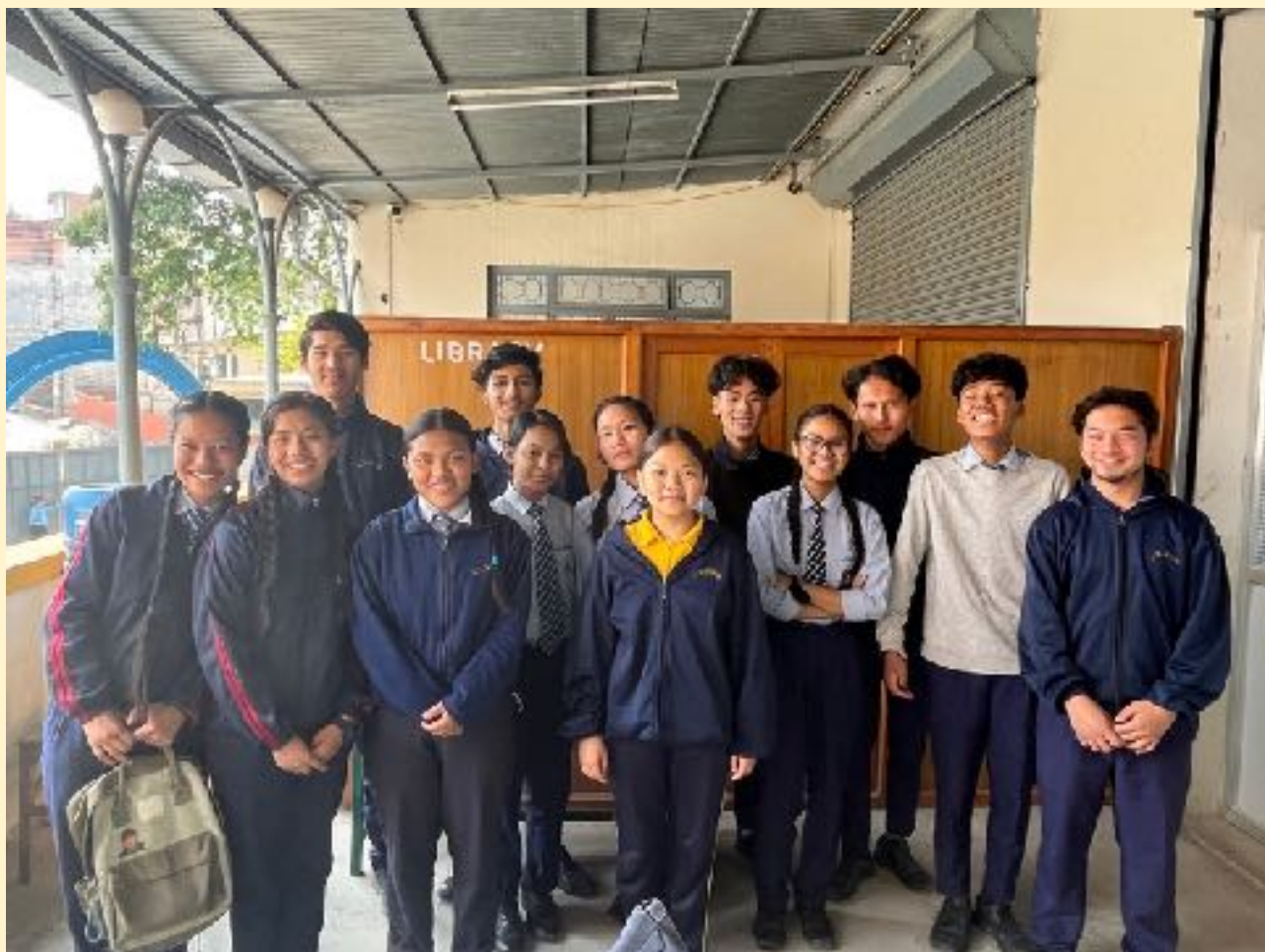
Class 10 students from Gangchen Samling School, supported by the Foundation, before the Secondary Education Exam

The preferred courses in this year were mainly in the social sciences and humanities, which open the doors to teaching or social work professions. It is a source of great joy and satisfaction to see so many young people from very poor families reach, thanks to their commitment and the help received over so many years, unhoped-for goals such as a degree and the necessary qualification to find a professional job!